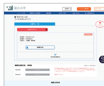
Application form PDF (image)